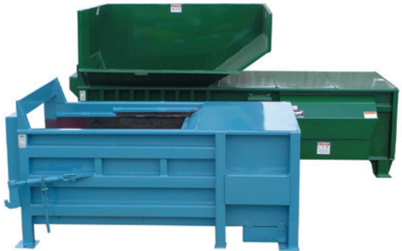
The TC-300T TANK (foreground) compared to a standard 3 cu. yd. compactor showing the difference in overall length — yet the clear-top opening of the TANK is the same as the larger RJ-325. The picture also illustrates that if the TANK is fitted with our standard 4-sided, rear feed hopper, there is no need for tread plates or guard rails in many applications.

The large clear-top opening accommodates large bulky items and delivers greater throughput capacity. The TC-300T TANK is ideal for dock feed applications. With our standard 4-sided, rear feed hopper, there is no need for special walk-on tops or guard rails in many applications.